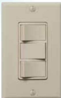
FV-WCSW31-W (white) FV-WCSW31-A (almond)