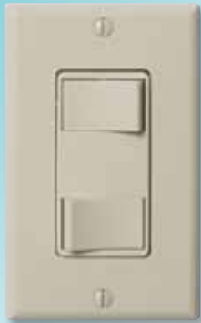
FV-WCSW21-W (white) FV-WCSW21-A (almond)