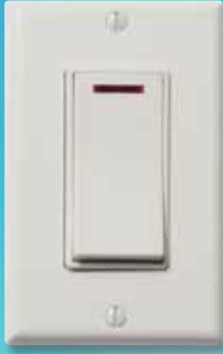
FV-WCSW11-W (white) FV-WCSW11-A (almond)