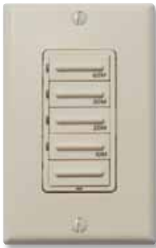
FV-WCD01-W (white) FV-WCD01-A (almond)

— Ideal for Panasonic's quiet fans to ensure you don't forget to shut them off